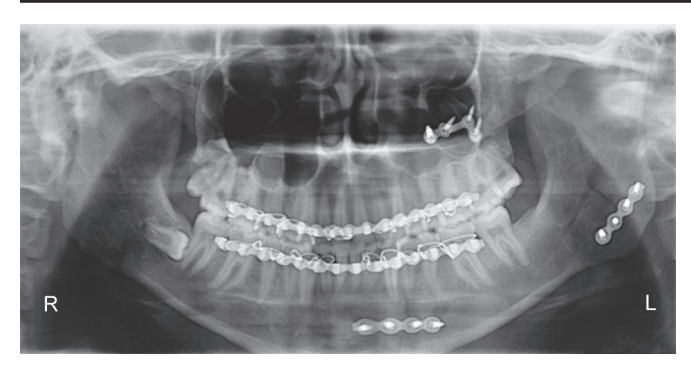
Fig. 5: Postoperative OPG of case 3 showing left linear vertical ramus fracture with left parasymphysis fracture fixed using miniplates.

used as it was found that the fractured fragments were rigidly fixed. Total intraoperative time was found to be 14 minutes for ORIF of ramus site fracture. Patient-reported for follow-up after 4 months with satisfactory occlusion and healing of fracture site.