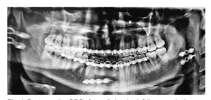
Fig. 4: Postoperative OPG of case 2 showing left linear vertical ramus fracture with right parasymphysis fracture fixed using miniplates patient was taken up for ORIF under general anesthesia. Same technique as described earlier was used to fix the fracture fragments (Fig. 2). Intraoperative time for

fixation of ramus fracture was recorded as 12 minutes. Postoperatively, satisfactory occlusion, as well as function, was achieved and maintained as seen at 6 months follow-up visit.