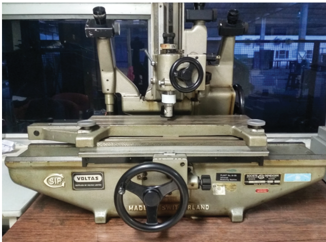
Fig. 2: Universal measuring machine

This in vitro study of various IRMs was conducted to compare the dimensional changes of four different recording materials over a period of five different intervals of time. The primary purpose of IRMs is to transfer the determined interocclusal relationship of the patient's jaws. 13 This transfer gains more importance because the diagnosis of a pathogenic occlusion is dependent upon it being clinically accurate and stable. While clinical accuracy largely depends on clinical variables, including the skill of the clinician or the neuromuscular ability of the patient, the stability of the interocclusal record depends largely on its inherent properties. It must be therefore overemphasized that duplication of occlusal relations and their transfer in the form of interocclusal records should have high standards to overcome materials' inherent