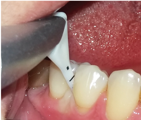
Fig. 4: Clinical application of the device in a periodontal pocket