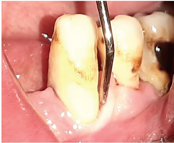
Fig. 2: Manual curettes debridement