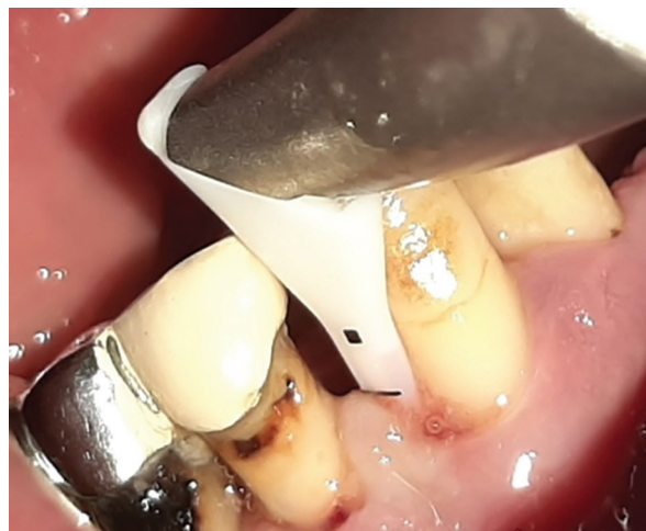
Fig. 1: Plaque removal by subgingival glycine powder air polishing

There were no statistically significant differences in the mean values of periodontal parameters between GPAP and MCD in ChP group at baseline and three months post-therapy ( p > 0.05 ).