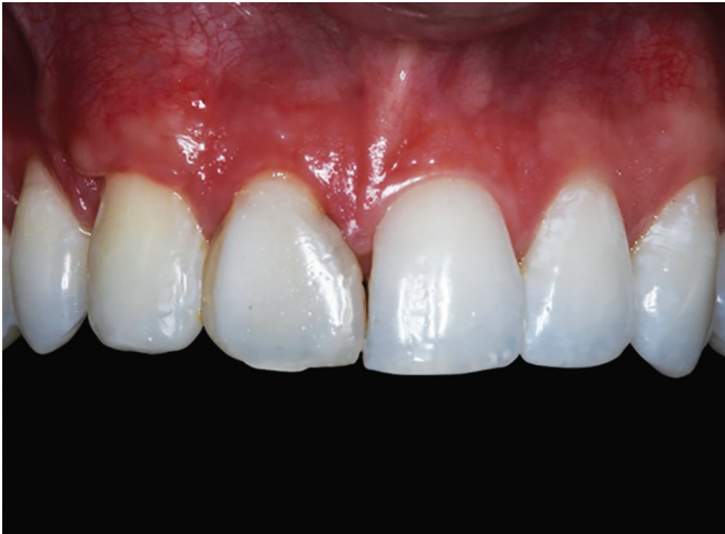
Fig. 4: Sixty days postoperative