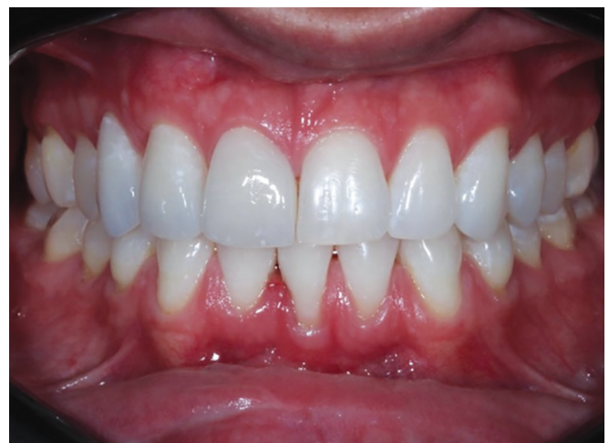
Fig. 6: One year after ceramic placement

After the preparation of the ceramic veneers by ceramist, the correct adaptation was verified, proceeding with the color test using try-in paste. For cementation, the preparations were cleaned with brush and prophylactic paste, the pieces were prepared with 10% hydrofluoric acid for 1 minute and 30 seconds and then with silane. The teeth were conditioned with 37% phosphoric acid for 15 seconds in dentin and 30 seconds in enamel, washed for 45 seconds, followed by primer and bonding with adhesive system (Scotchbond; 3M ESPE, Seefeld, Germany) and polymerized for 20 seconds. The cement