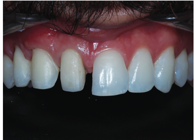
Fig. 5: Teeth preparation

teeth root in view of great root volume, seeking a better esthetic and prognosis of connective tissue graft (Fig. 3).