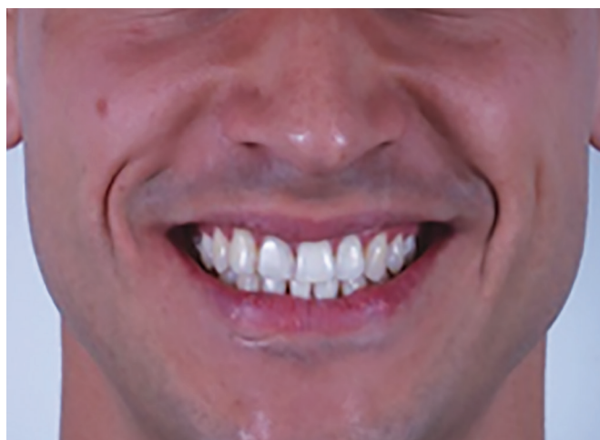
Fig. 1: Initial facial aspect