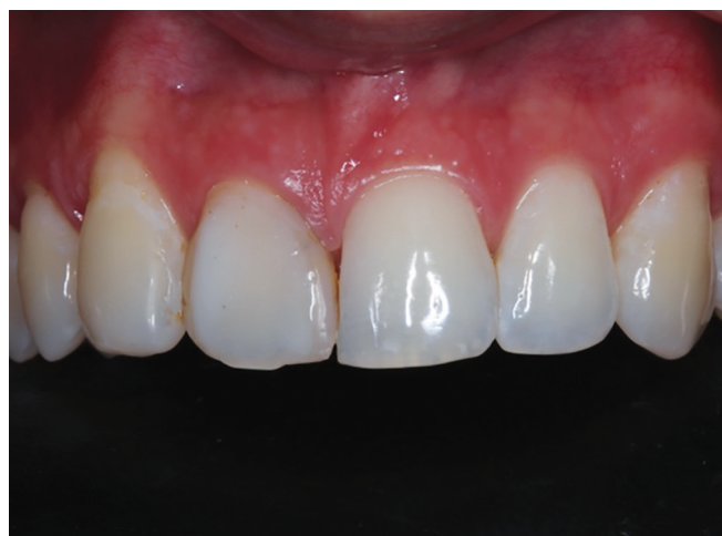
Fig. 2: Initial oral aspect

to restorative treatment. Whether for repositioning the gingival margin or for restoring tissue thickness lost over time, an esthetic/functional surgical planning should be carefully evaluated and performed. 5