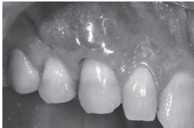
Fig. 6: Subepithelial connective tissue graft by the modified envelope technique—postoperative monitoring 180 days (test group)