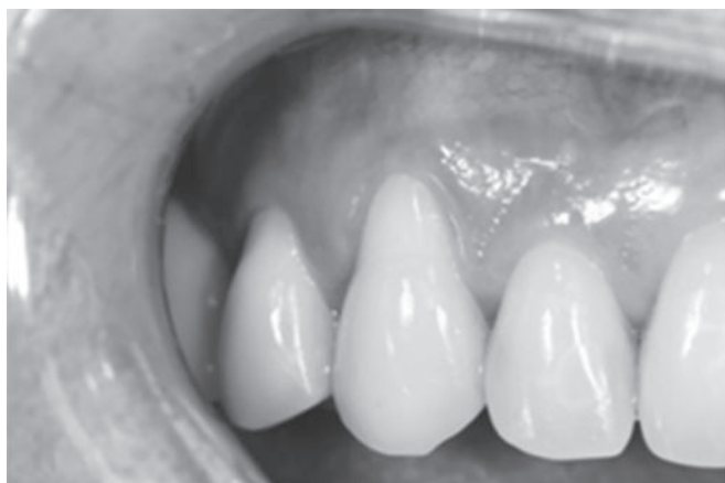
Fig. 1: Subepithelial connective tissue graft by the coronally positioned flap technique—initial (control group)