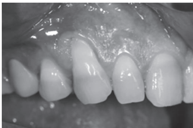
Fig. 3: Subepithelial connective tissue graft by the modified envelope technique—initial (test group)

All data were analyzed and evaluated initially through Shapiro–Wilk tests for checking the normal distribution, and then analysis of variance and Tukey’s tests were used. The only exception was the analysis of the sensitivity