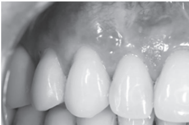
Fig. 5: Subepithelial connective tissue graft by the coronally positioned flap technique—postoperative monitoring 180 days (control group)