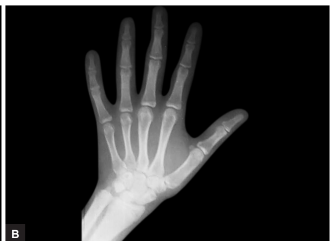
Figs 4A and B: Coincidence of (A) stage G with capping and (B) stage H with fusion

Stages E and F are coincident with the epiphyseal widening in the third finger proximal, middle phalanx and middle phalanx of the fifth finger. Test of significance showed significance at p<0.01.