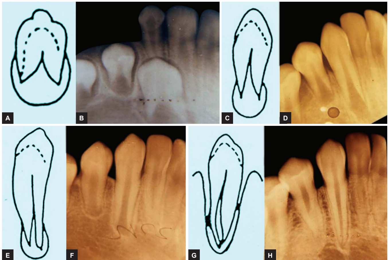
Figs 3A to H: Demirjian's stages of mandibular canine calcification. Stage E (A and B): The walls of the pulp chamber from straight lines whose continuity is broken by the presence of the pulp horn. The root length is less than the crown height. Stage F (C and D): The walls of the pulp chamber now form a more or less isosceles triangle. The apex ends in a funnel shape. The root length is equal to or greater than the crown height. Stage G (E and F): The walls of the root canal are now parallel and its apical end still partially open. Stage H (G and H): The apical end of the root canal is completely closed. The periodontal membrane has a uniform width around the root and the apex

standard deviation of 2.18. The test of significance was not significant.