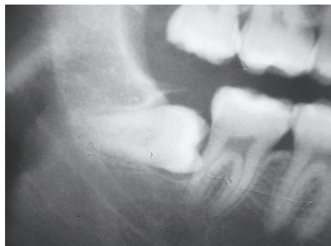
Fig. 1: Impacted mandibular third molar with radiolucent follicular space

In the present case, a 20-year-old female reported with chief complaint of pain in the left mandibular third molar region. On intraoral examination, inflamed area was notice near the retromolar area. Panoramic radiograph revealed mesioangularly impacted left third molar with pericoronal radiolucency of about 2.5 mm (Fig. 1). During extraction of third molar, a very small cystic cavity was noticed surrounding the crown of the impacted third molar. The tooth was extracted along with soft-tissue which was attached to the cemento-enamel junction and sent for histopathological examination (Fig. 2). Histopathological examination revealed a small cystic space lined by epithelium of two to three cell layers thick resembling REE (Fig. 3). The final