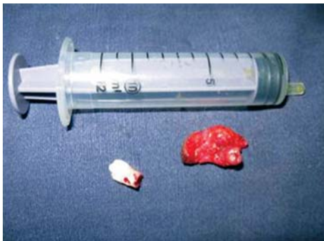
Fig. 4: Excised sinus tract with tooth