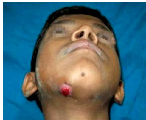
Fig. 2: Extraoral presentation (Case 1)

Radiographic examination revealed impacted 43.