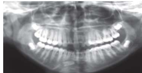
Fig. 1: Orthopantomogram (OPG)

Odontogenic sinus tracts are the most common cause of a chronically draining, fixed, nodulocystic papule of the face and neck. 1 Cutaneous fistulas or sinus tracts of dental origin are well documented in the literature and respond extremely well to appropriate dental therapy. However, the majority of patients with odontogenic sinus tracts present to their physicians for treatment of an acute or chronic mass or a draining skin lesion. Since many of these patients have no dental symptoms, a high degree of suspicion is required to make the correct diagnosis. Because these lesions are often misdiagnosed, they are also ineffectively treated. Such patients may undergo multiple surgical excisions and biopsies and receive many courses of antibiotics, but all such measures fail and the sinus tract recurs. 2 We report two cases of extraoral sinus tracts, which were diagnosed as cutaneous sinus tracts of dental origin only after the failure of initial misdirected therapy.