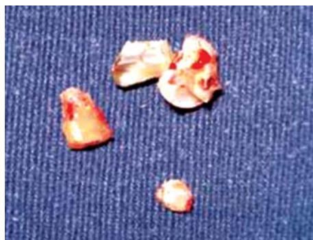
Fig. 7: Impacted tooth removed

follow-up was done at 1st, 2nd, 3rd weeks and 1month, which showed no signs of recurrence (Figs 1 to 4).