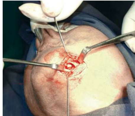
Fig. 6: Surgical exposure (Case 2)